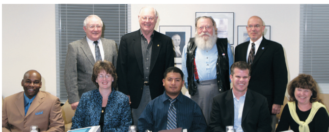
November 7, 2006