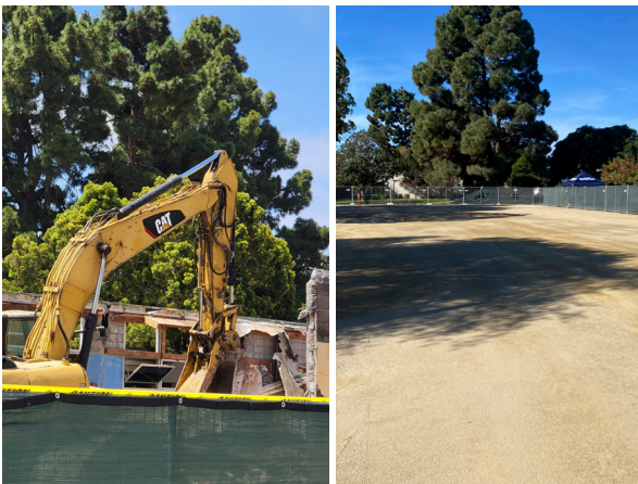
Buildings E & F during and after demolition.